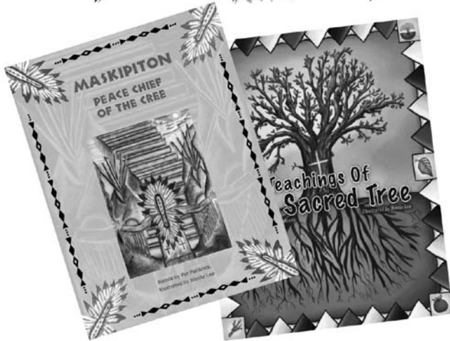
Books from the Reaching up to God our Creator curriculum