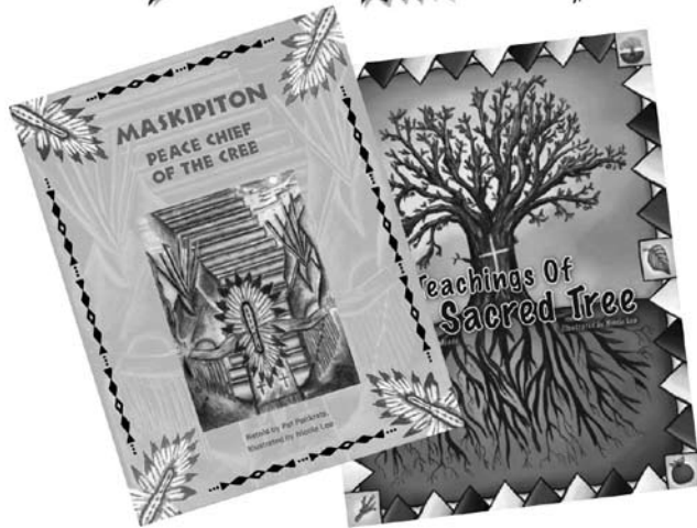
Books from the Reaching up to God our Creator curriculum