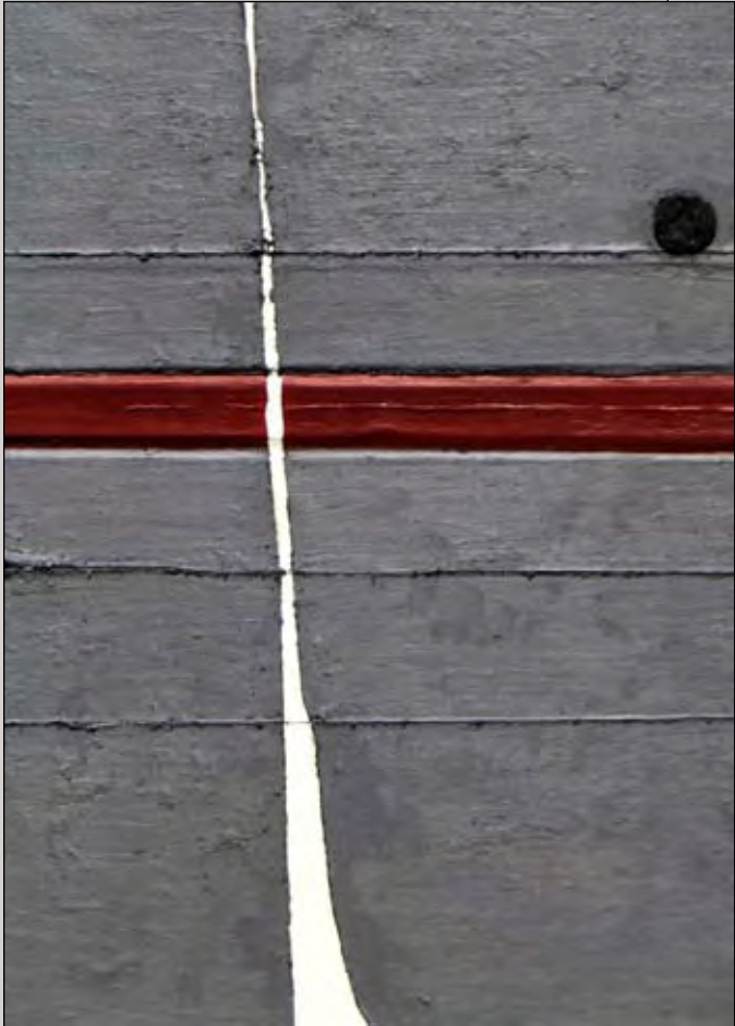
one is a lonely number detail