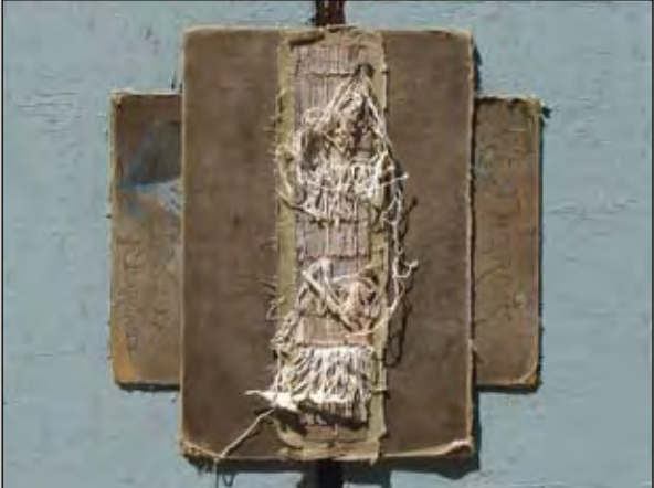
apology close up