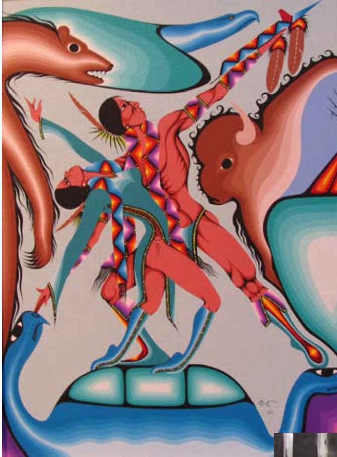
Ovid Charlette, Compaction of Reflections Wild Life are Representatives of Subjects , acrylic on canvas board