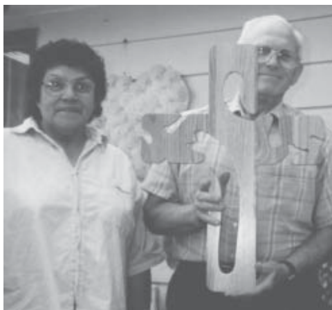
Volunteers offer their time, experience and abilities to the congregations they serve through JoinHands.