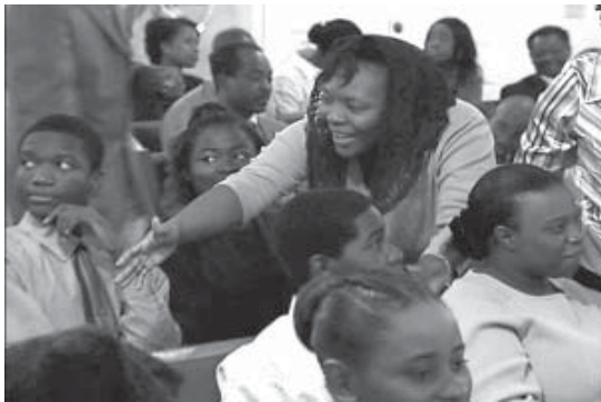
Unity Pentecostal in Miami, Florida, welcomes strangers and friends to their church which was established with the help of a JoinHands grant.