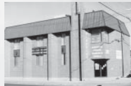
Edmonton Chinese Mennonite Church & Edmonton Vietnamese Mennonite Church, Alberta, Canada