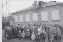
Zaporozhnye Evangelical Mennonite Church, Zaporozhnye, Ukraine

Yes, I want to help construct meetinghouses for new Mennonite congregations.