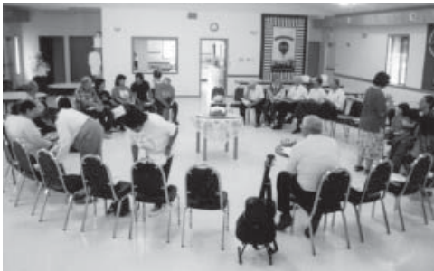
The word of God is shared in story and song at Riverton Fellowship Circle, Riverton, Manitoba.