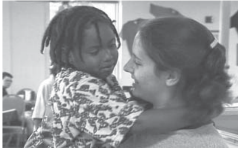
The church family is nurtured at Agora Christian Fellowship, Columbus, OH.