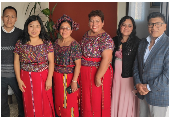
SEMILLA students and church leaders

CASAS, SEMILLA's Central American Study program has arranged the tour to include a wide variety of experiences to give you exposure to what Anabaptist churches are doing in Guatemala as well as a sense of the challenges and joys they face, in addition to visiting areas of special interest.