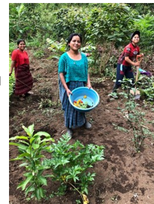
Community Cloud Forest Conservation Project

Participants should plan to arrive in Guatemala City on October 16 and depart October 27. Arrangements and fare for travel to and return from Guatemala City are the responsibility of tour participants.